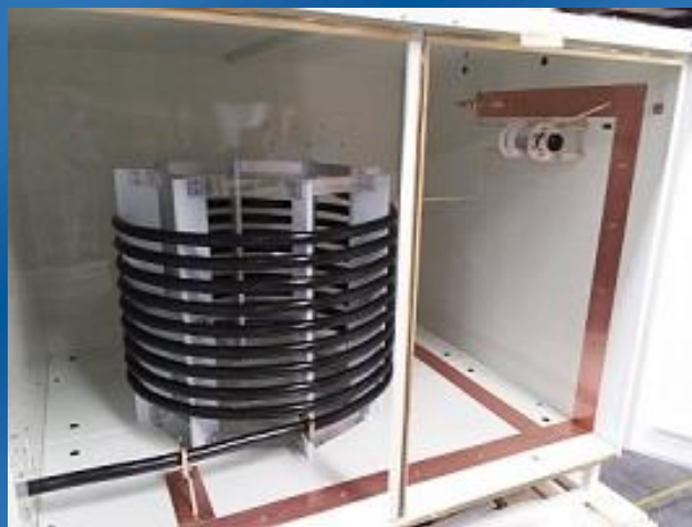
Armored Trunk Hybrid High Capacity Cable Isolation Inductor in Weatherproof Housing